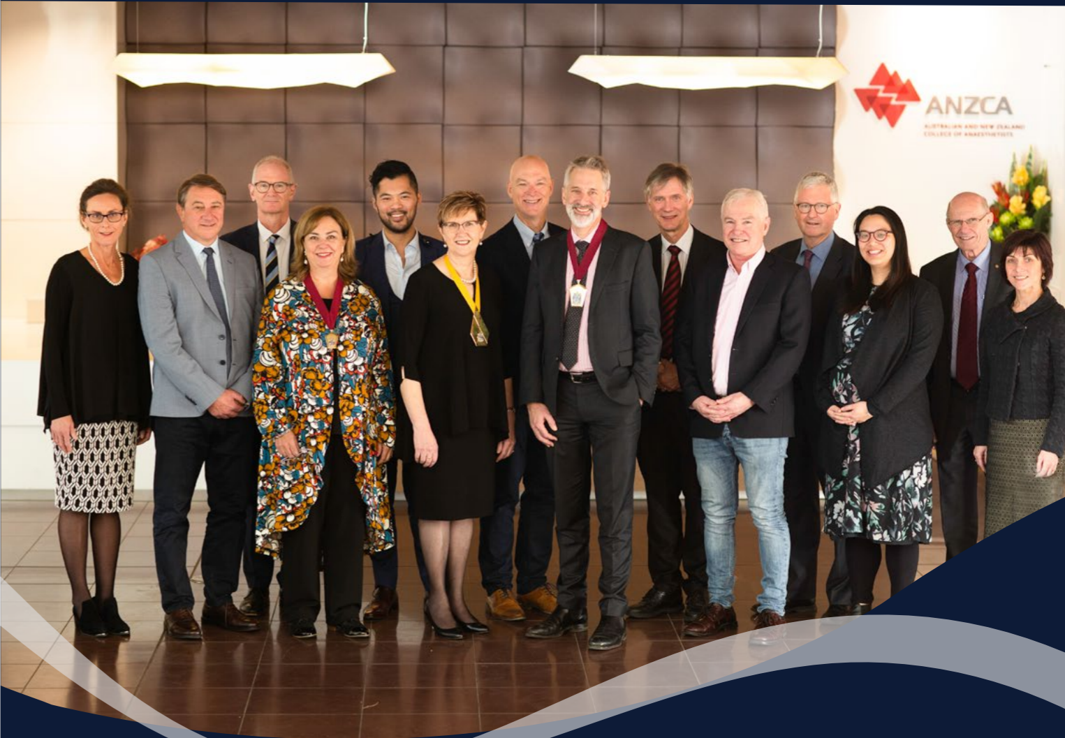
ANZCA Council, from left: